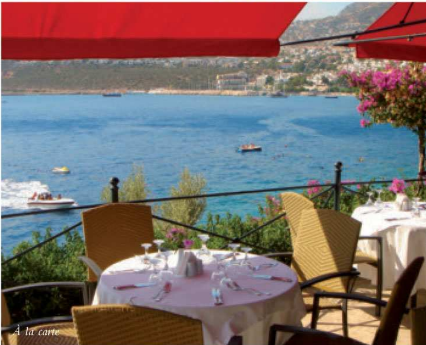
À la carte

Close to the swimming pools are the main à la carte restaurant and the Patara bar; while around the Hotel are the Agora Bar and restaurant, as well as the Bezirgan, which offers Turkish culinary delights.