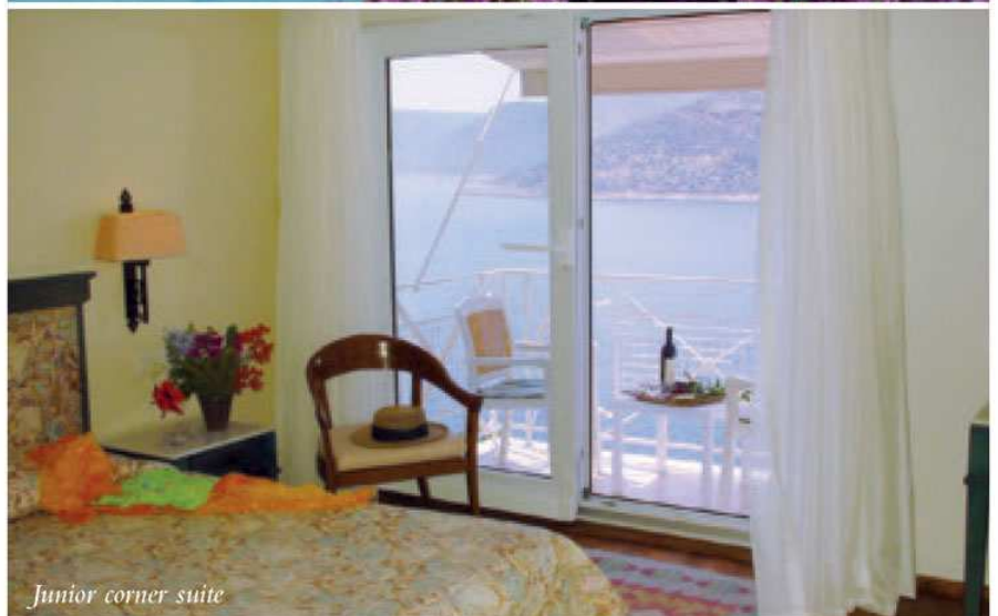
Junior corner suite